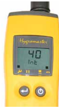
Set interval 1 minute to 24 hours