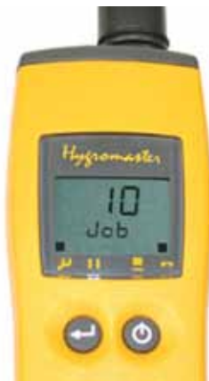
Assign job numbers to data