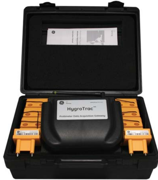
HygroTrac in carrying case

This product complies with FCC Part 15 Class B, ICES-003 Class B, European Union EMC and R&TTE Directive. Wireless devices require specific country approvals. Contact GE Sensing for the latest listing.