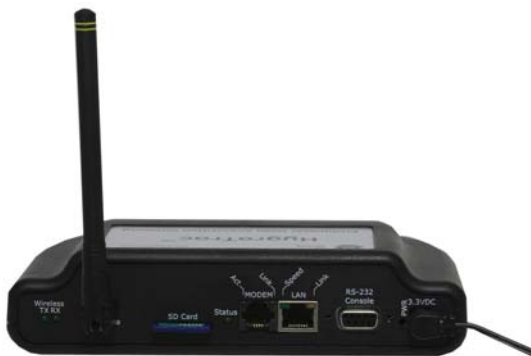
HygroTrac gateway rear view

*Use of dial up connections will require an ISP account.